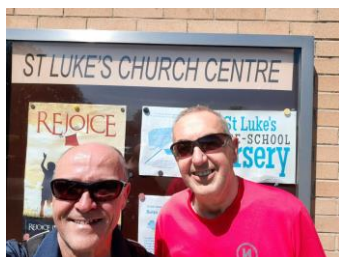
Back at Lodge Moor

All money will be sent to CA via the walks committee and the final amount announced in the September News sheet.